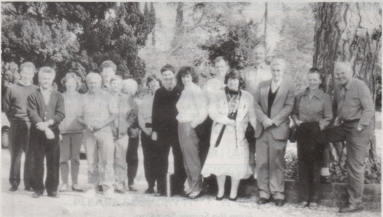
Group photograph taken at the Annual General Meeting