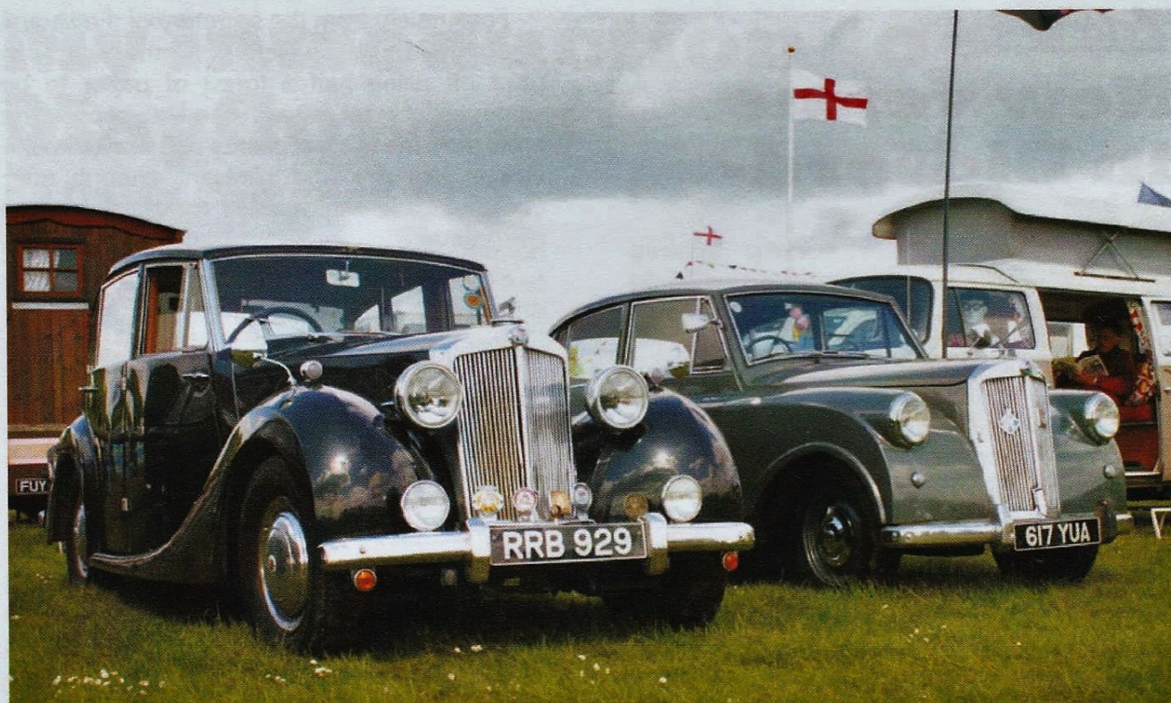
Dave's Renown alongside "Little Nell"

When we got around to exploring there were the most diverse and interesting standing displays of various related personal collections of railway and motoring interest. A little short on the catering outlets I felt but we were able to get a bacon buttie rewarding the time and patience it took to deliver, and later in the day we had some very welcome and cheap chips.